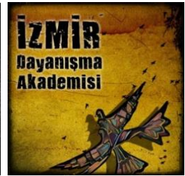
Solidarity Academy of Izmir