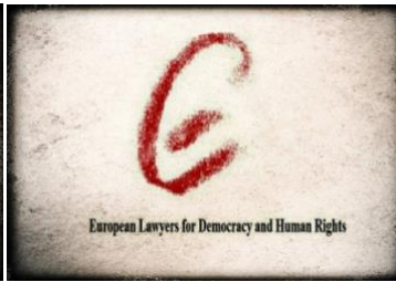
European Association of Lawyers for Democracy and World Human Rights