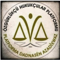
Platform of Lawyers for Freedom